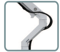
CABLES ROUTE BENEATH THE ARM, OUT OF THE WAY