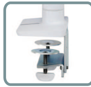
INCLUDED: STANDARD 2-PIECE DESK CLAMP ATTACHES TO SURFACE EDGE