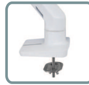
INCLUDED: GROMMET MOUNT ATTACHES THROUGH SURFACE HOLES