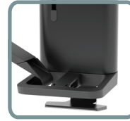
SLIM PROFILE 98-490-224 (MATTE BLACK)