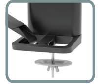
GROMMET 98-492-009 (MATTE BLACK)