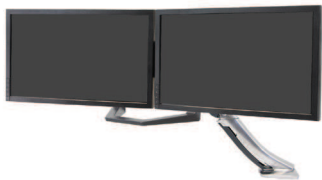
DUAL MONITOR & HANDLE KIT (BLACK) 97-718-009