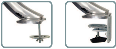
MOUNT TO YOUR DESK WITH EITHER A GROMMET MOUNT OR A DESK CLAMP