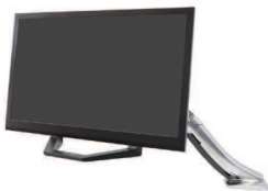
MONITOR & HANDLE KIT (BLACK) 97-760-009