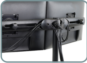
CABLES ARE GUIDED CLEANLY THROUGH CABLE CHANNELS