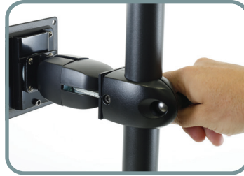
MONITOR HEIGHT CAN BE ADJUSTED ON POLE (33-091-200 SHOWN). 28" POLE (20-137-200) ALSO AVAILABLE, ORDER SEPARATELY.