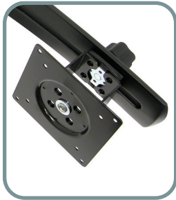
MONITORS CAN BE ALIGNED INTO A SEAMLESS CURVED PROFILE TO BENEFIT VIEWING.