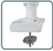
WHITE GROMMET MOUNT KIT ACCESSORY 98-035: ATTACHES THROUGH SURFACE HOLE