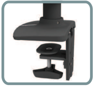
INCLUDED: STANDARD 2-PIECE DESK CLAMP ATTACHES TO SURFACE EDGE