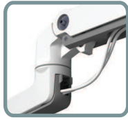
CABLES ROUTE BENEATH THE ARM, OUT OF THE WAY