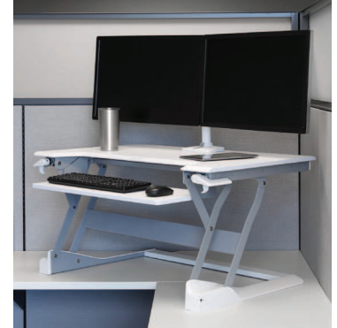
SHOWN WITH WORKFIT-TL SIT-STAND WORKSTATION

THE LOW-PROFILE MONITOR CROSS-BAR PROVIDES A COMPACT RANGE OF MOTION