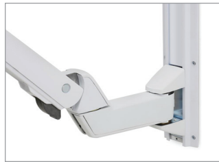
SV Sit-Stand Combo Extender, Short