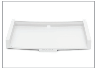
Keyboard Tray with Debris Barrier Upgrade Kit