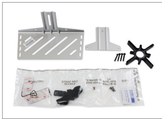
SV Camera Shelf