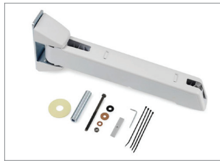
SV Sit-Stand Combo Extender