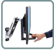
Monitor & Handle Kit (black) 97-760-009 Dual Monitor & Handle Kit (black) 97-718-009