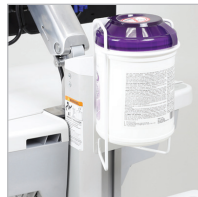
SV SANI-WIPES HOLDER