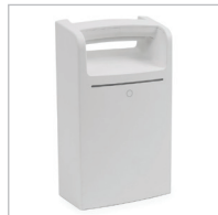
LIFEKINNEX™ POWER SYSTEM

Additional accessories available at healthcare.ergotron.com .