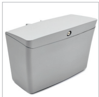
SV STORAGE BIN