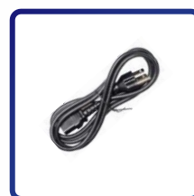
Power Cord x 1