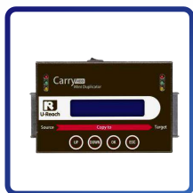
PRO118M Duplicator x 1