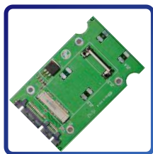
mSATA to SATA Adapter-P1041