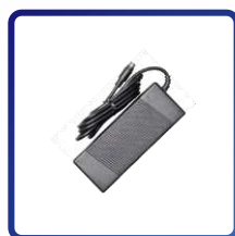
12V Power Adapter x 1