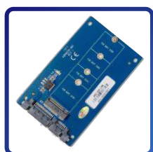
M.2(NGFF) to SATA Adapter-P1051