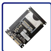
CFast to SATA Adapter-P1053